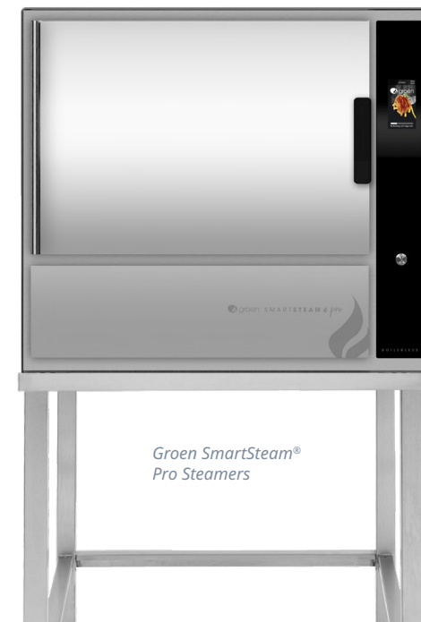
Groen SmartSteam® Pro Steamers