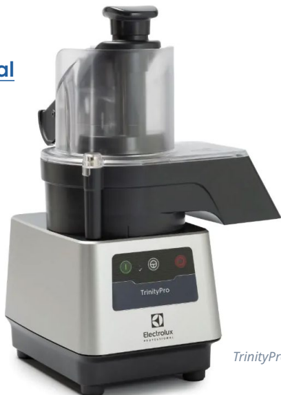
TrinityPro Vegetable Slicer

Your staff can do much more in much less time (and far less injury risk) than manual prepping. That adds up to big labor savings.