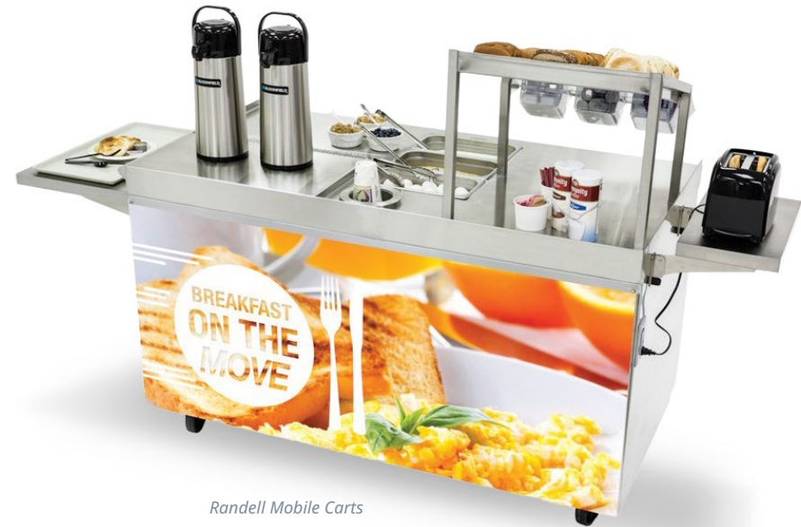
Randell Mobile Carts

Serve meals anywhere, whether in hallways, classrooms, or sporting events. Plus, you can reduce cafeteria crowding with a strategically placed lunch-time mobile cart.