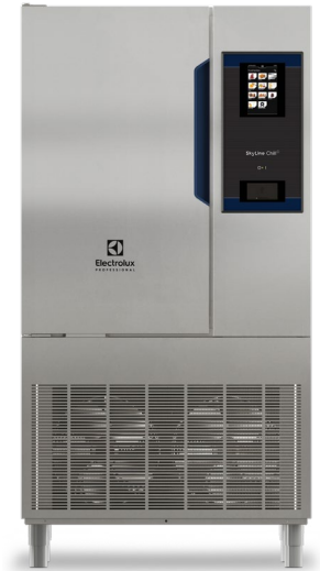
SkyLine Blast Chiller

The SkyLine Blast Chiller and Freezer allows your team to pre-prepare food in bulk, with each chill cycle saving your staff 47 extra minutes. That gives them more time to take on tasks that can transform your foodservice program.