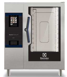
SkyLine Combi Oven