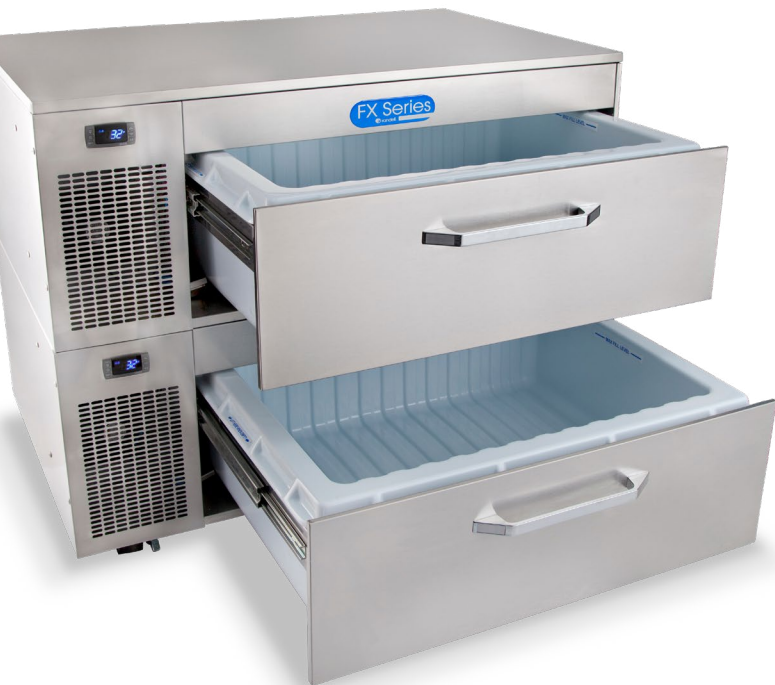
Randell Precise Temp FX Series

Keep ingredients fresh and easily accessible, minimize the need for frequent trips to walk-in coolers, speed up meal preparation, and streamline workflow to save valuable time for your team.