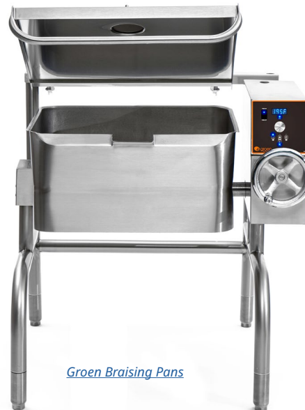
Groen Braising Pans