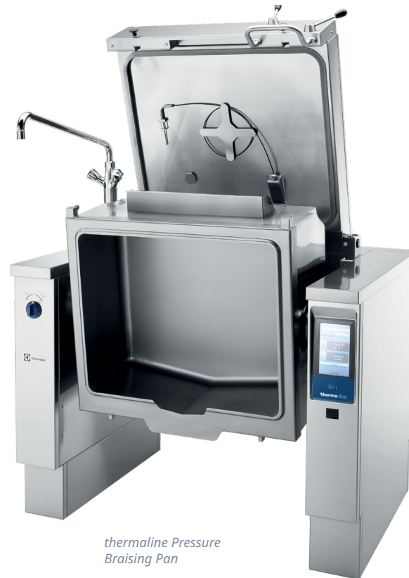
thermaline Pressure Braising Pan

Students can easily grab cold milk (or other beverages) and you have peace of mind that they remain at the perfect temperature. A must-have for any school kitchen.